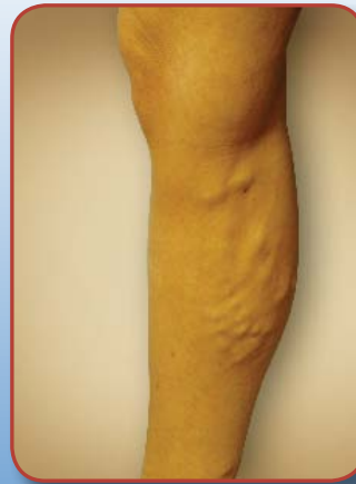
Varicose Veins BEFORE