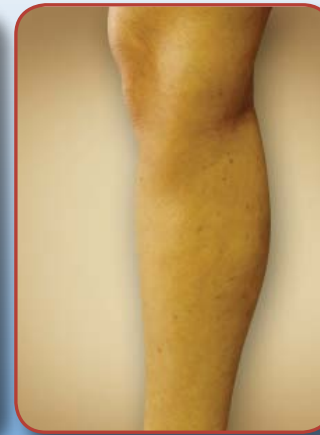
Varicose Veins AFTER